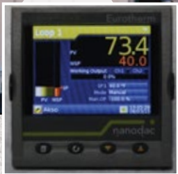
Programmable Logic Controller