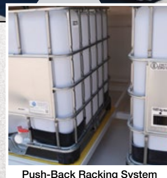
Push-Back Racking System